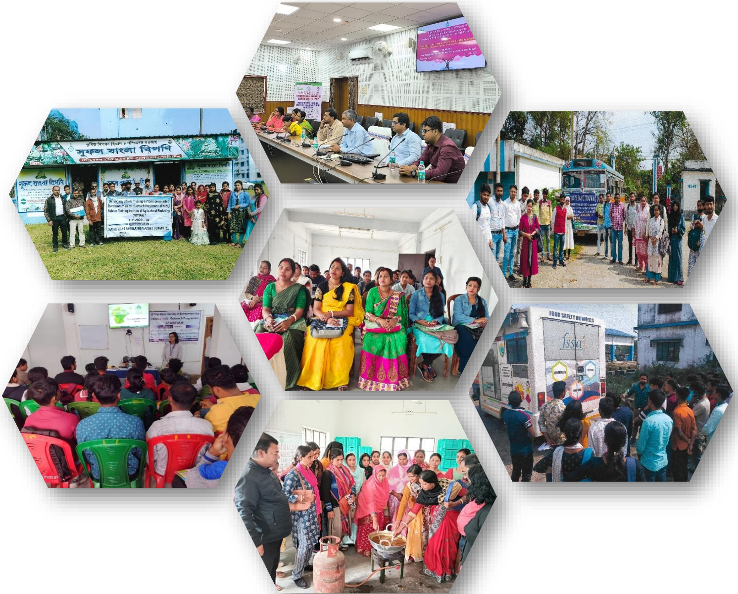
Glimpse of different trainings conducted by NSTIAM during this quarter