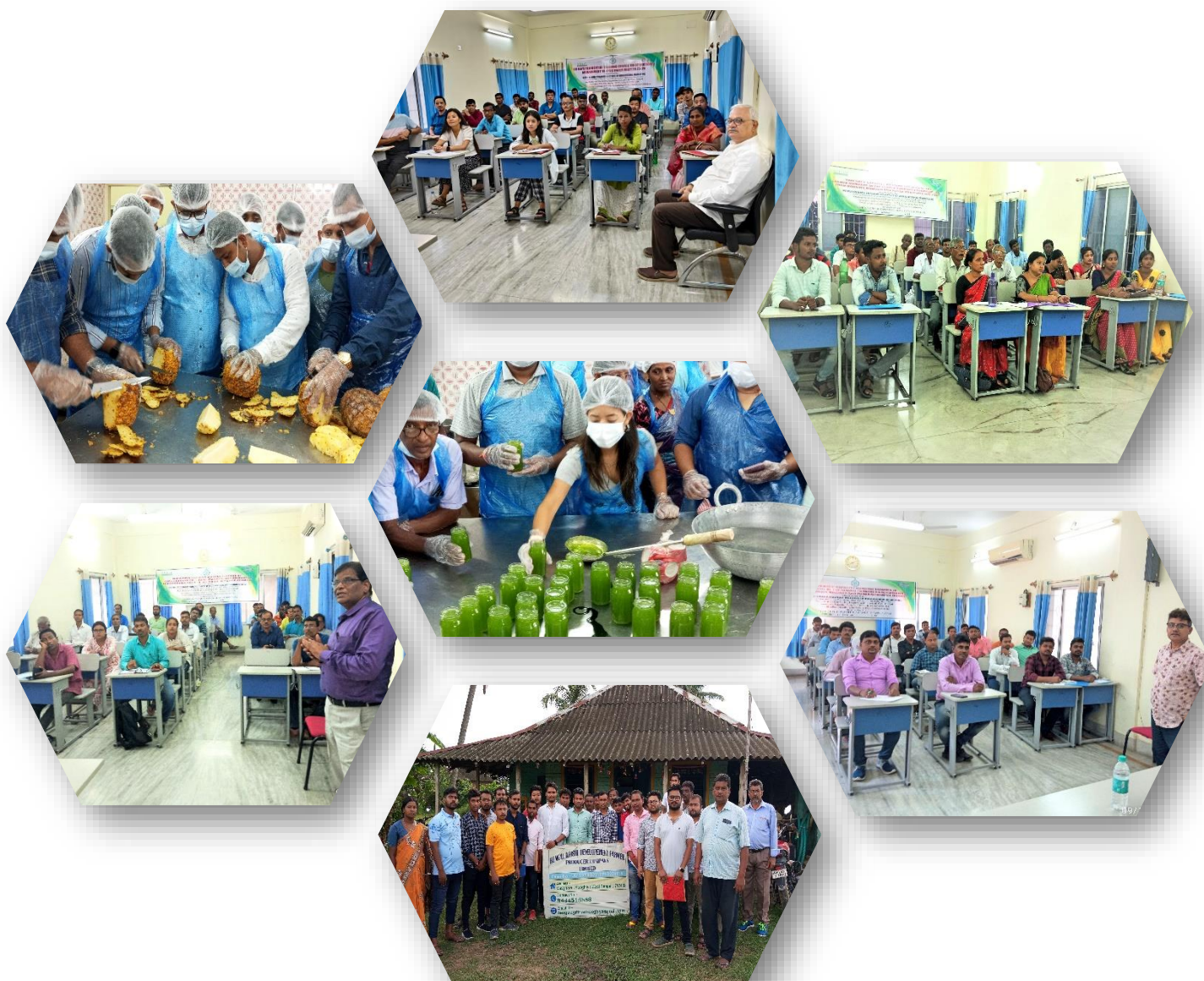
Glimpse of different training and workshops conducted by NSTIAM during this quarter